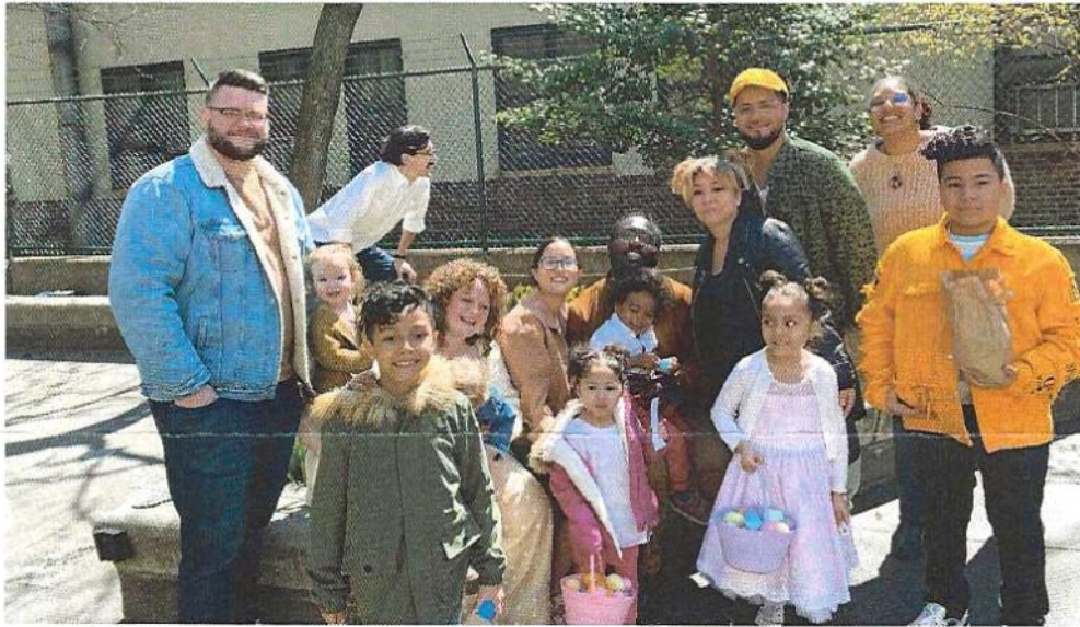
A group of us at ECC church

We feel excited anticipation, as we prayerfully seek the Lord, believing He will direct our next "yes!" Thank you for joining us. It means the world to us, and we pray it will be a season of blessing and alignment for you, as well.