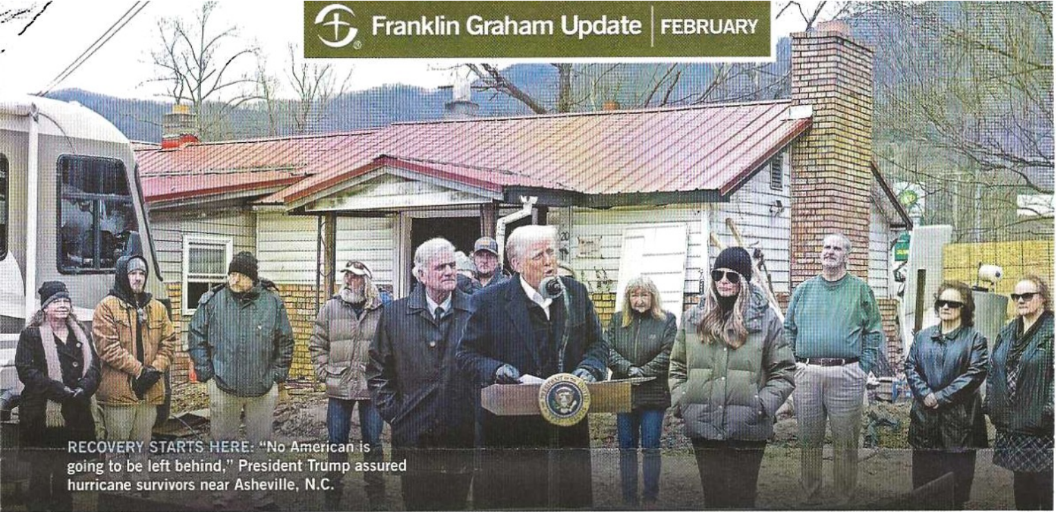
RECOVERY STARTS HERE: "No American is going to be left behind," President Trump assured hurricane survivors near Asheville, N.C.