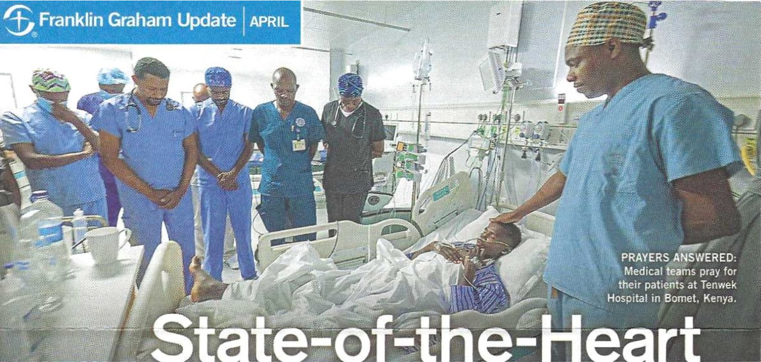
PRAYERS ANSWERED: Medical teams pray for their patients at Tenwek Hospital in Bomet, Kenya.