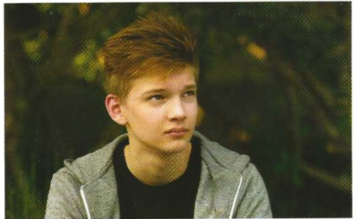
Your gift by Thanksgiving provides a filling meal to a hungry child.

It's so important that each child has access to nourishing meals each day. When children don't know where their next meal will come from, they have a hard time believing that anyone will provide for their most basic needs. Meaning a hungry kid is often a kid who feels unworthy of being loved.