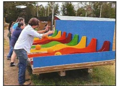
pie pumpkins while going on a hayrack ride! They concluded