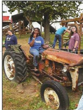
They had the best time there together, playing and exploring, riding grown-up tricycles, racing around