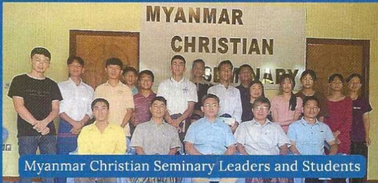
Myanmar Christian Seminary Leaders and Students