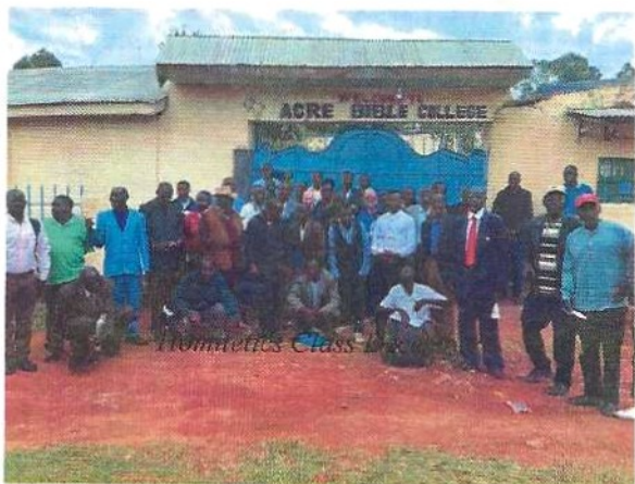
Ancient History & the Bible Class Picture